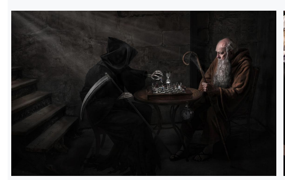
Fargo photographer places fifth in worldwide photo competition