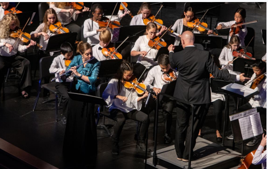
Encore: Growing ranks of student musicians prompts third ensemble for Fargo Moorhead Area Youth Symphonies