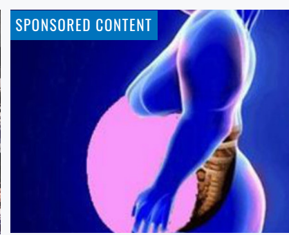
Shark Tank Keto Diet Stuns Millions { By Ketozin